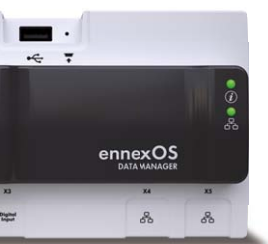
PEAK3 Solution with Inverter and Data Manager

The PEAK3 system solution is ready for ennexOS, SMA's pioneering digital platform. ennexOS converges the data of all relevant energy sectors to realize modern, forward-looking products in the energy industry. The platform is gradually extended and currently offers powerful features such as satellite-based performance ratio monitoring. Further information: www.ennexos.com